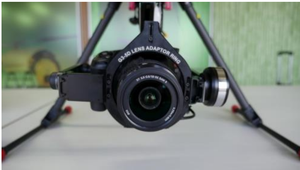
Camera position after CG adjust