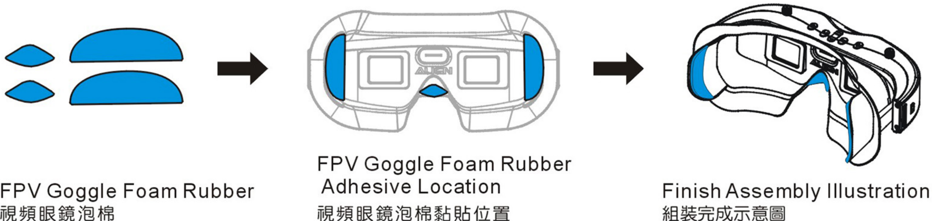
FPV Goggle Foam Rubber 視頻眼鏡泡棉